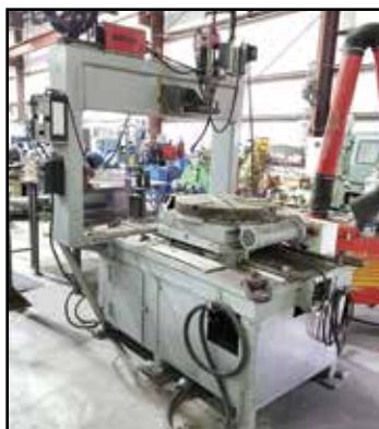
BORTECH Bridge Type Welding System