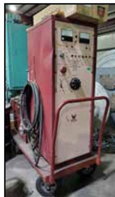
PHENIX Motor Voltage Test Unit