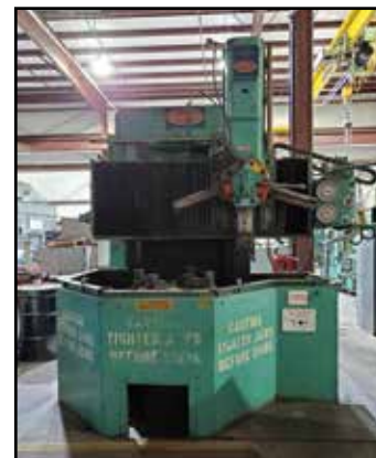
BULLARD Dynatrol 36" Vertical Turret Lathe

Inspection: Day Prior to Auction from 9AM - 4PM