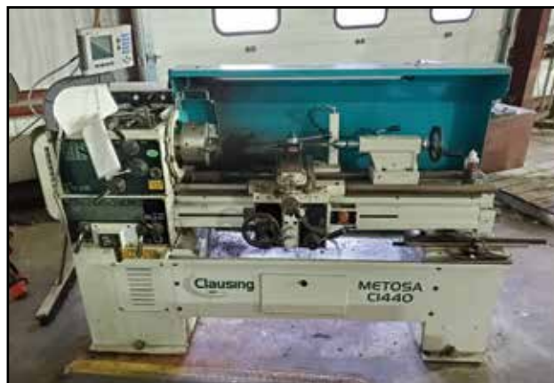
CLAUSING METOSA C1440 Engine Lathe