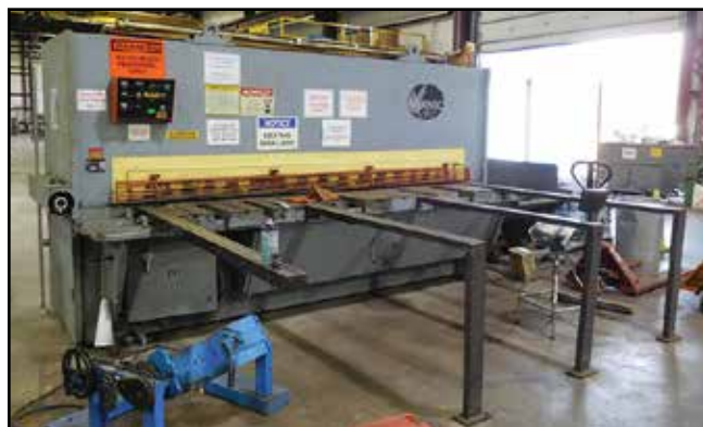
ATLANTIC 10' x 1/2" Hyd. Power Shear