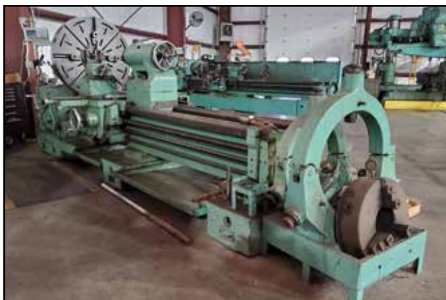
MUESER M-IV-5 Engine Lathe