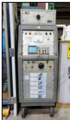
Coil Insulation Analyzer