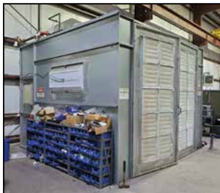
STANDARD TOOL Walk-In Spray Booth