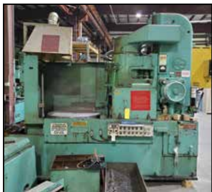
BLANCHARD 20K-36 Vertical Turret Lathe