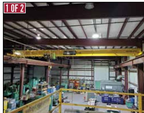
DESHAZO Single Glider Bridge Crane, 10-ton & 5-ton